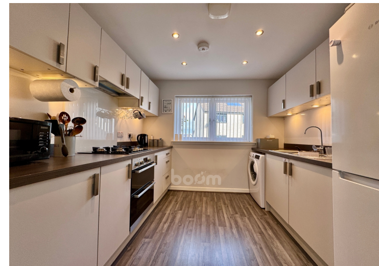
12 Auldlea Gardens, Beith