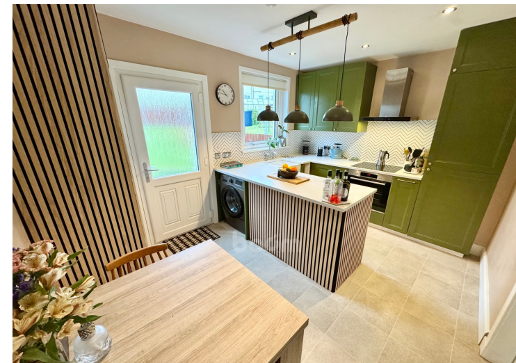
18 The Grove, Kilbarchan