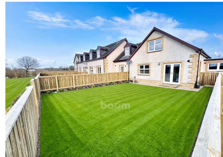
6 Selvieland Farm Cottages Houston Road, Houston