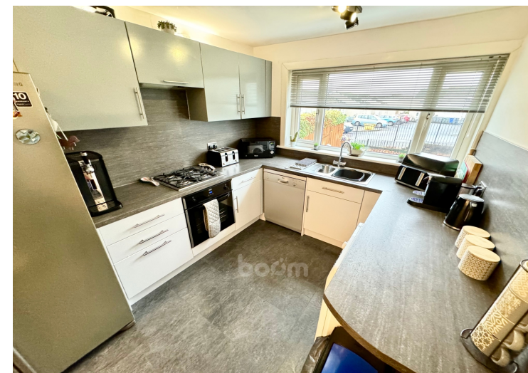
11 Hopeman, Erskine