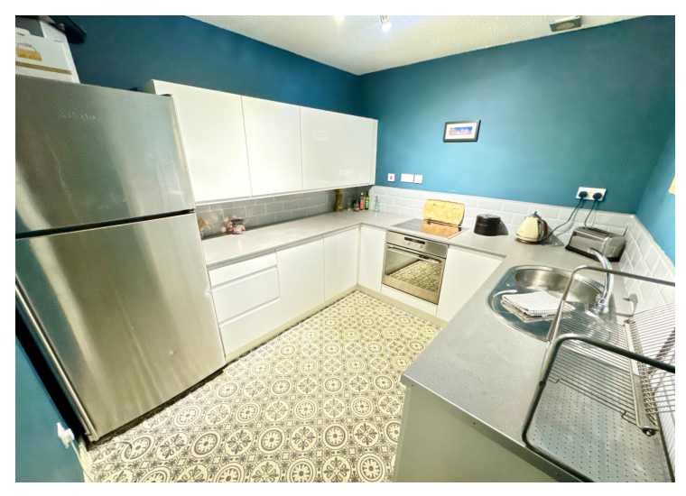
3-3, 49A Glasgow Road, Cambuslang