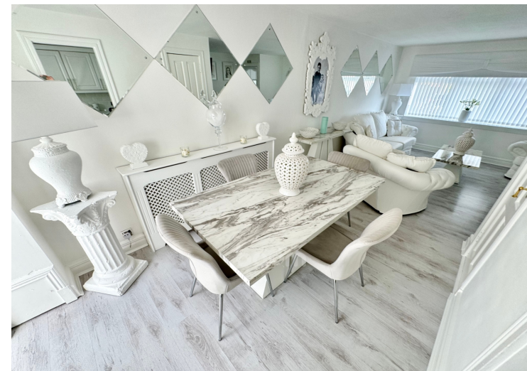
4 Nairn Court, Kilwinning