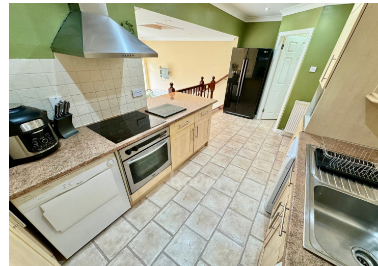
Quarry Drive, Kilmacolm