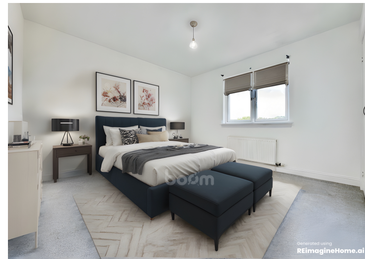
23, Flat 3/2 Loch Place, Bridge of Weir