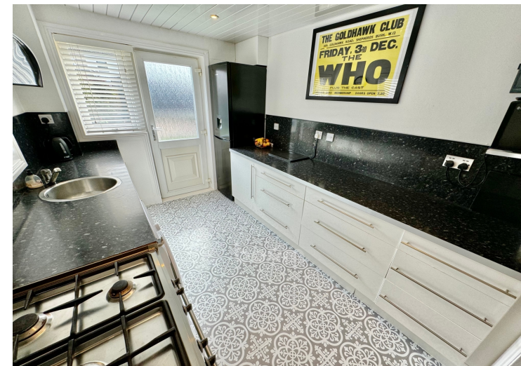
17 Maxwell Court, Beith