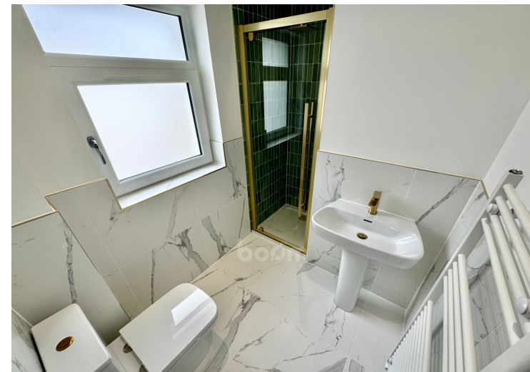
Eglinton Gardens, 39 Head Street, Beith