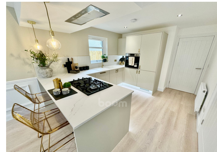
Eglinton Gardens, 37 Head Street, Beith