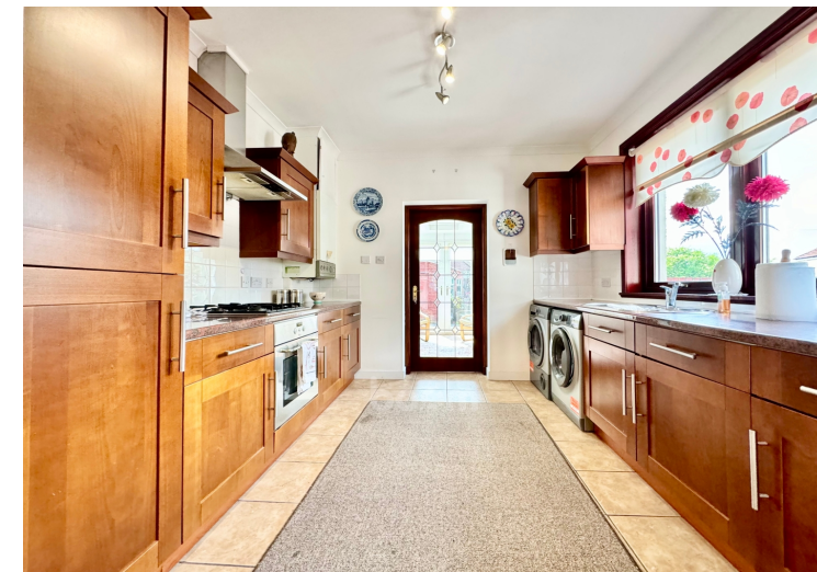
7 Elms Place, Beith