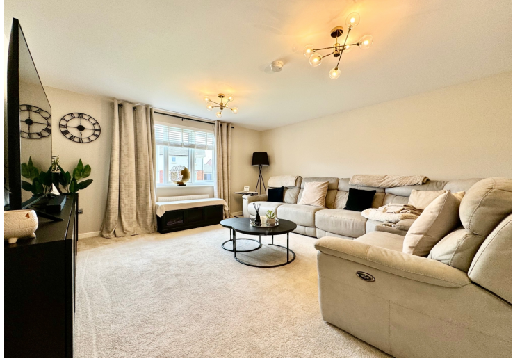
48 Doulton Road, Paisley