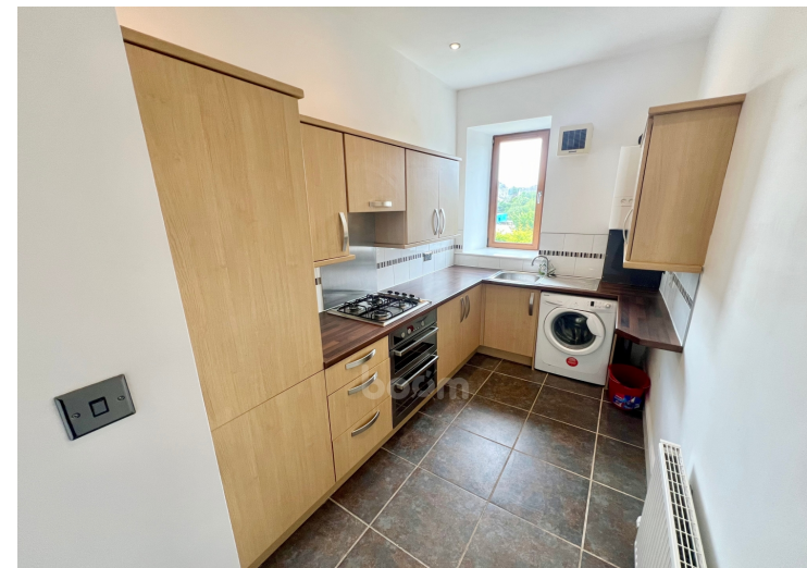
8 Knoxville Road, Kilbirnie