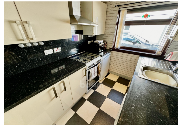
2 Ryeside Place, Dalry