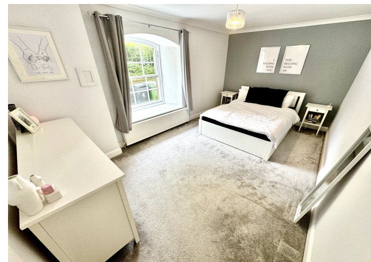
4 Loanhead Lane, Linwood