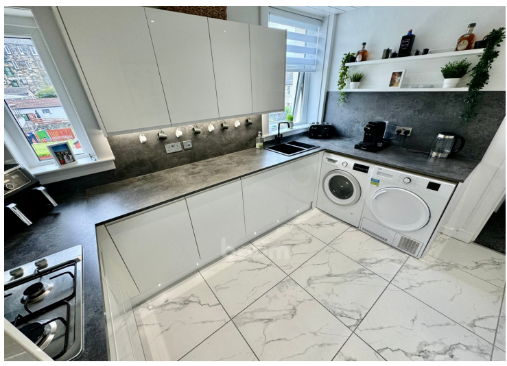
58 Whitehaugh Avenue, Paisley