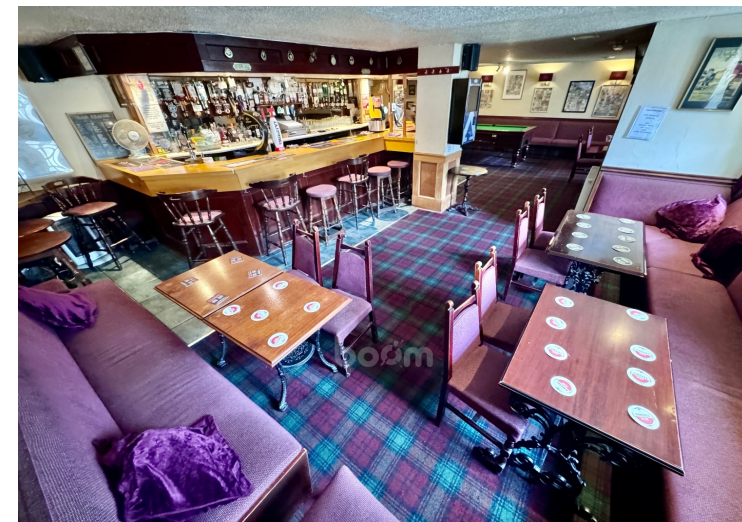
Maybole Arms, 35/37 Kirkoswald Drive, Maybole, KA19 7DX