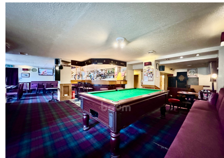
Maybole Arms, 35/37 Kirkoswald Drive, Maybole, KA19 7DX