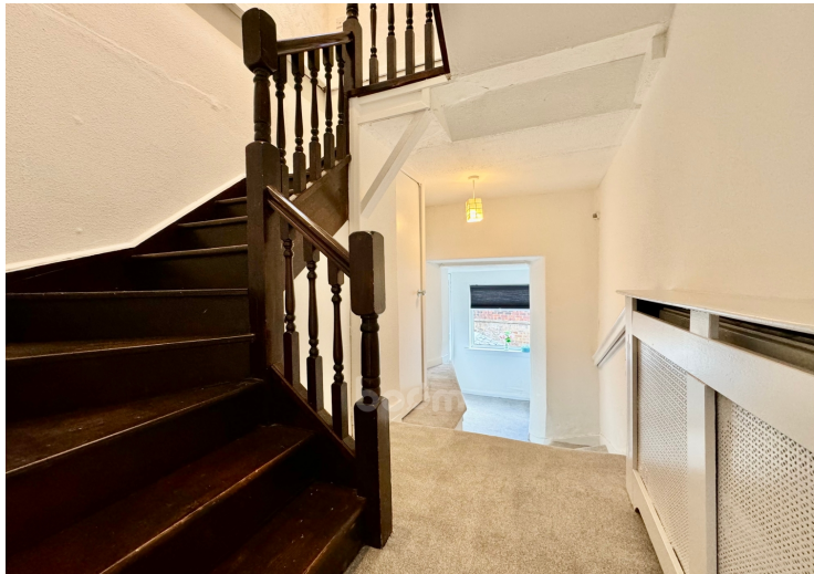
Offers Over £145,000