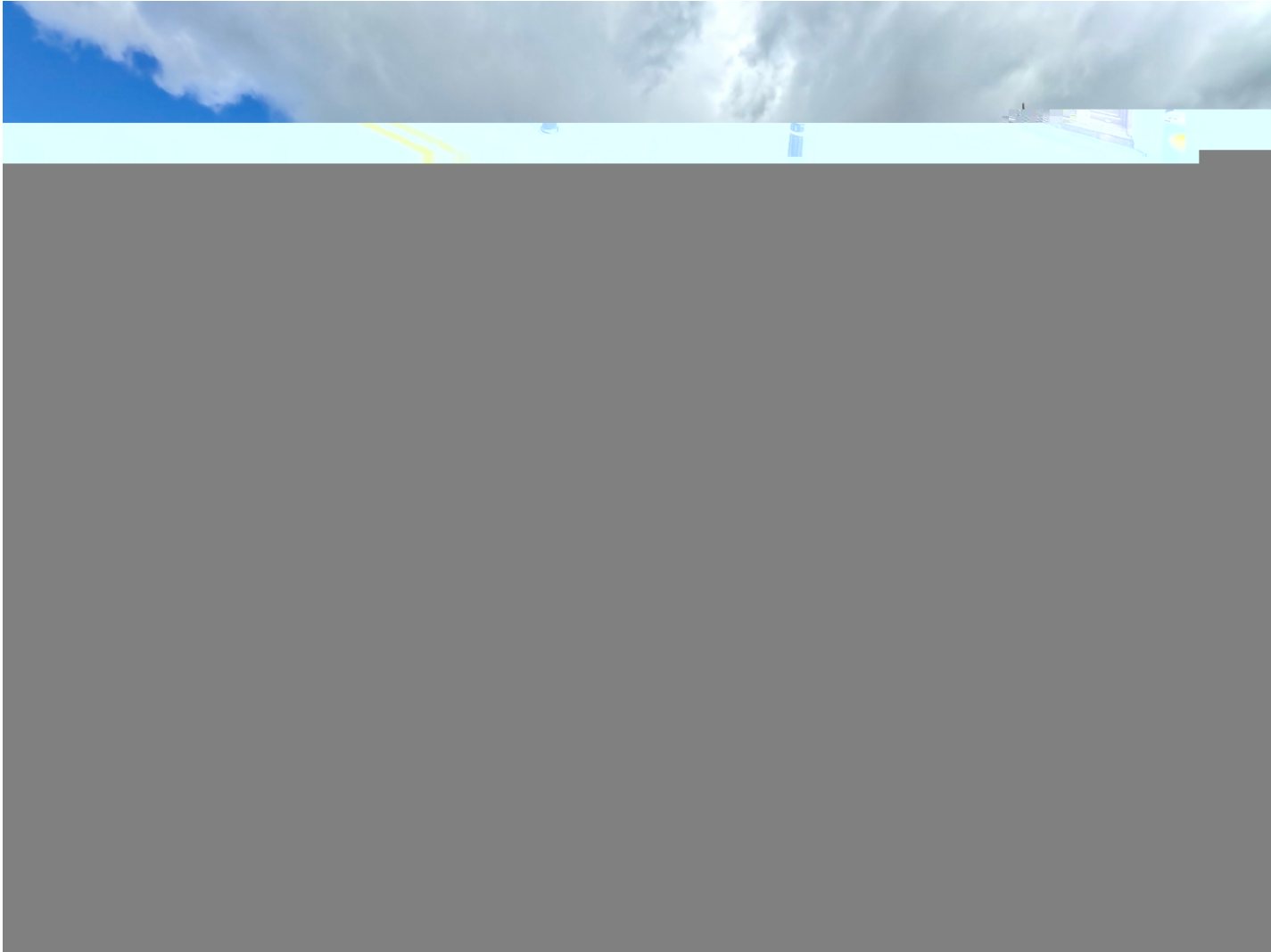
26 New Street, Dalry