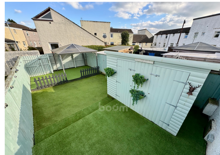
Braehead, Girdle Toll, Irvine