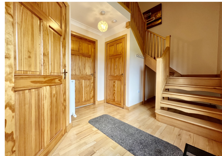
1 Baidland Meadow, Dalry