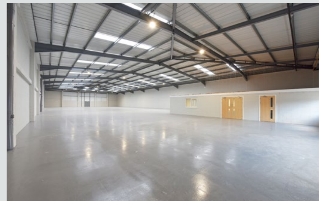
Indicative images of adjoining unit