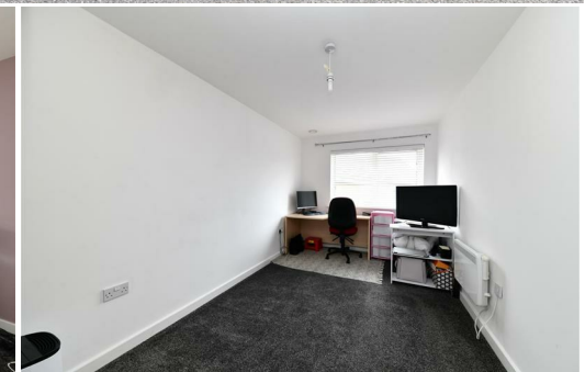
Anise Court, Admiral Drive Stevenage | SG1 4GA