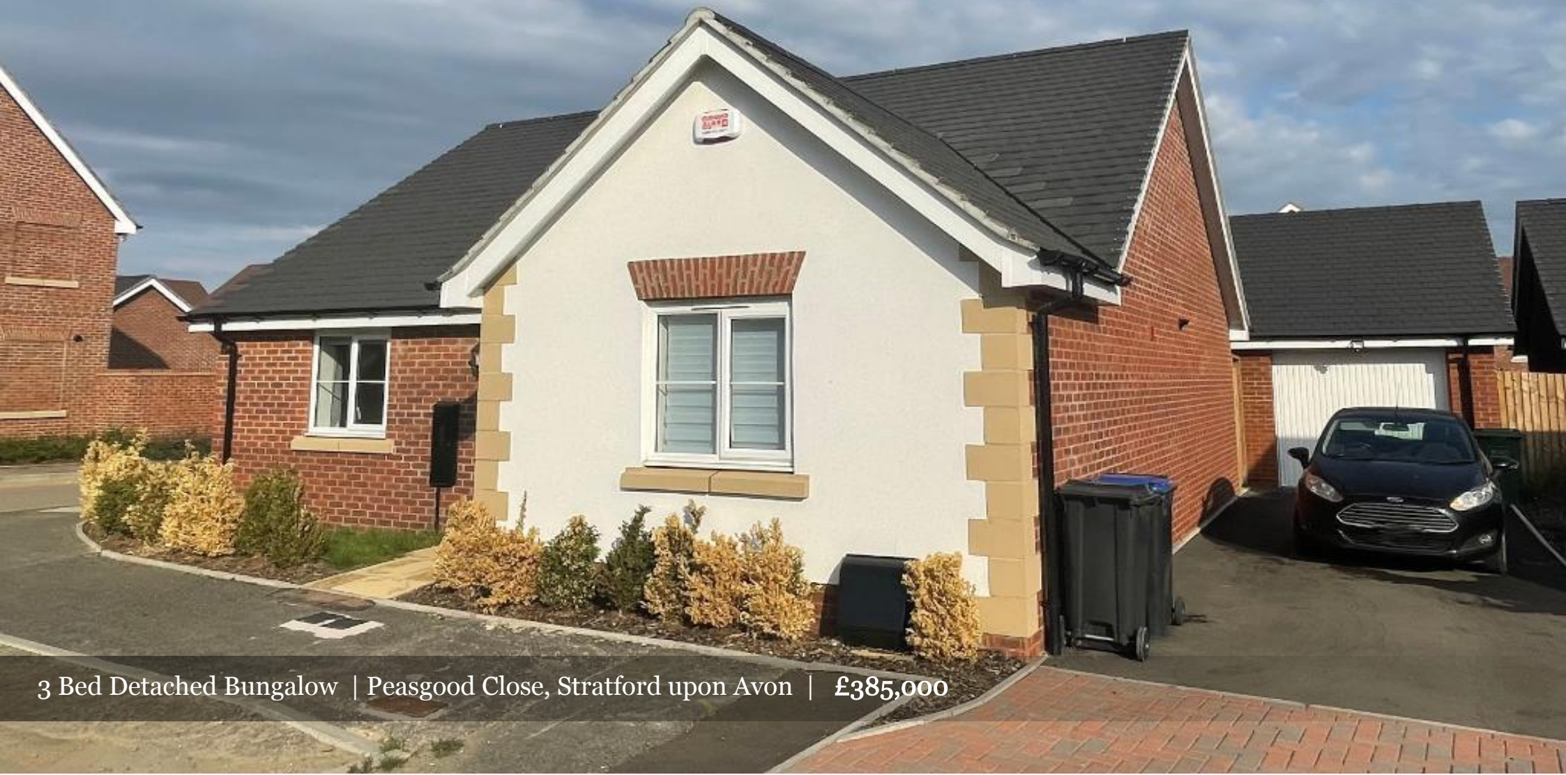
3 Bed Detached Bungalow | Peasgood Close, Stratford upon Avon | £385,000