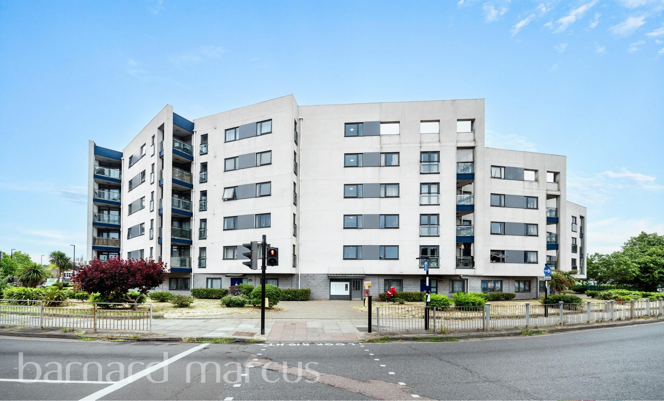
Orchard Court Bell Green, London SE26 4EN