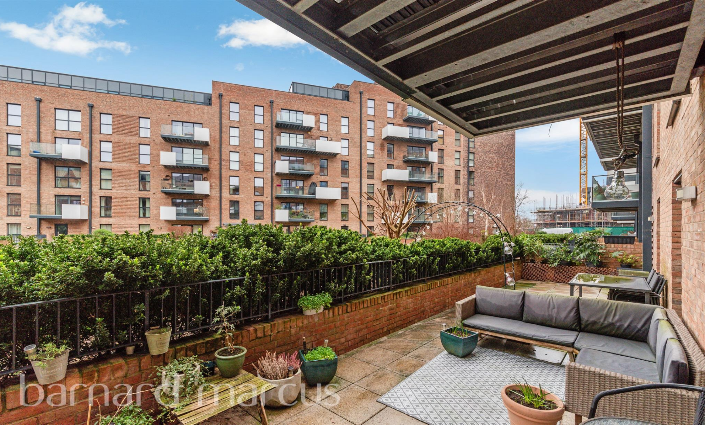
Purbeck Gardens, London SE26 5FE