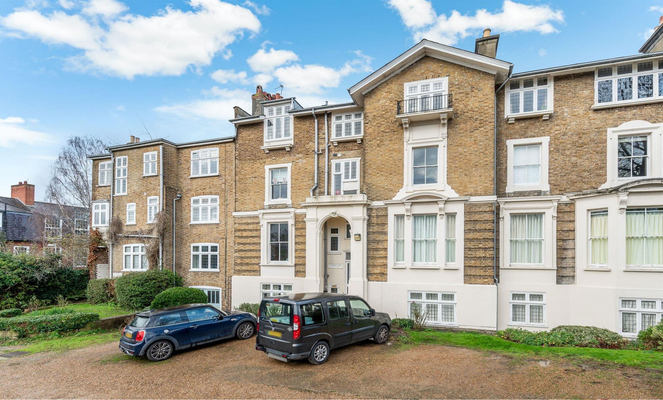
Courtside Dartmouth Road, London SE26 4RE