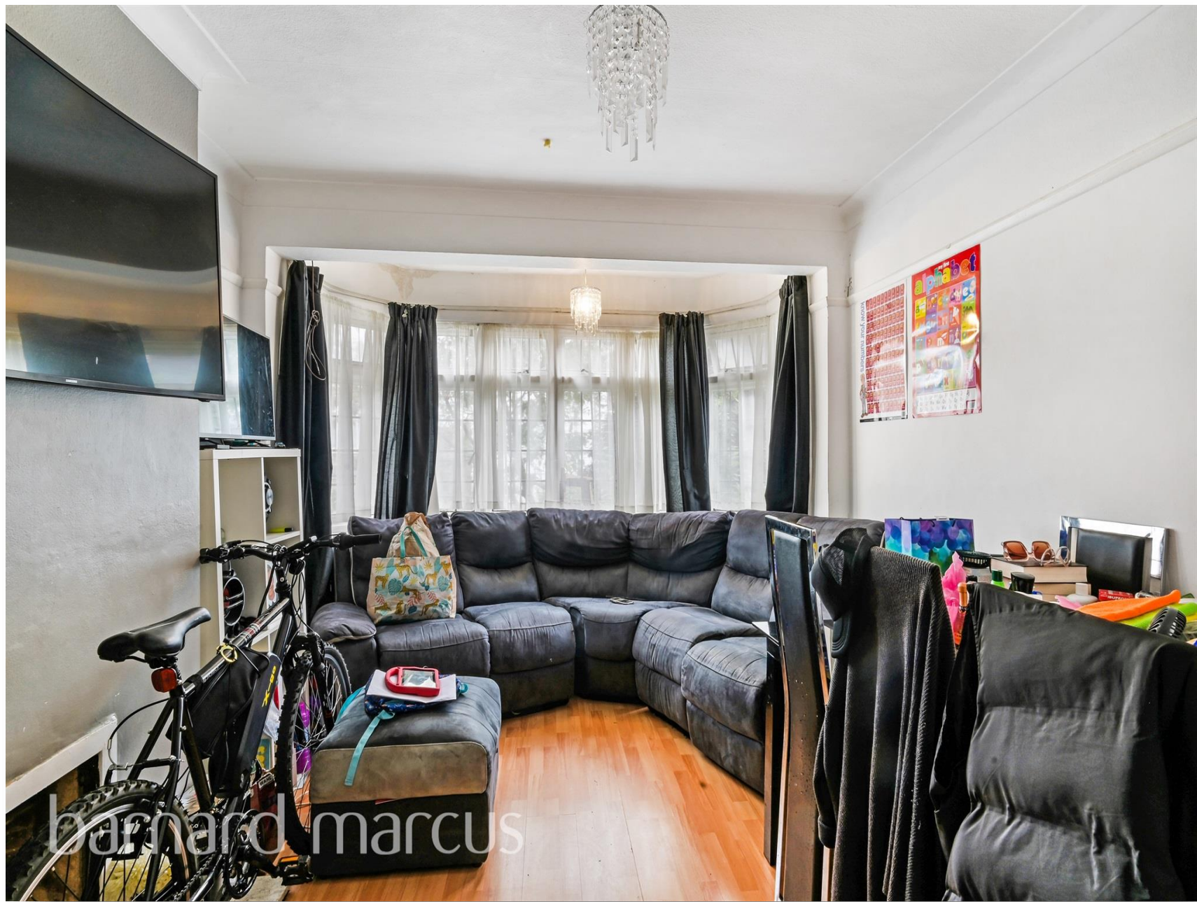
Grove Court Addington Grove, London SE26 4JS