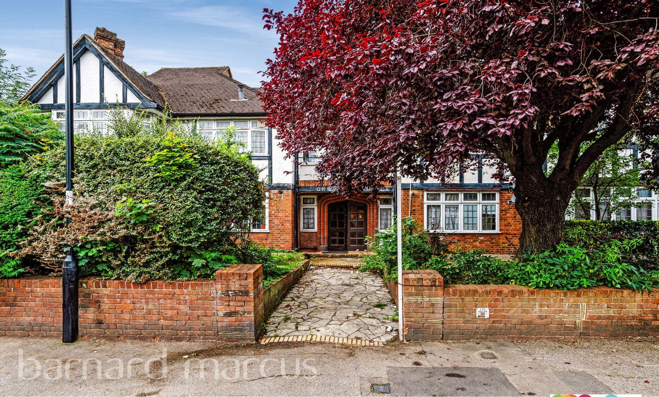
Grove Court Addington Grove, London SE26 4JS