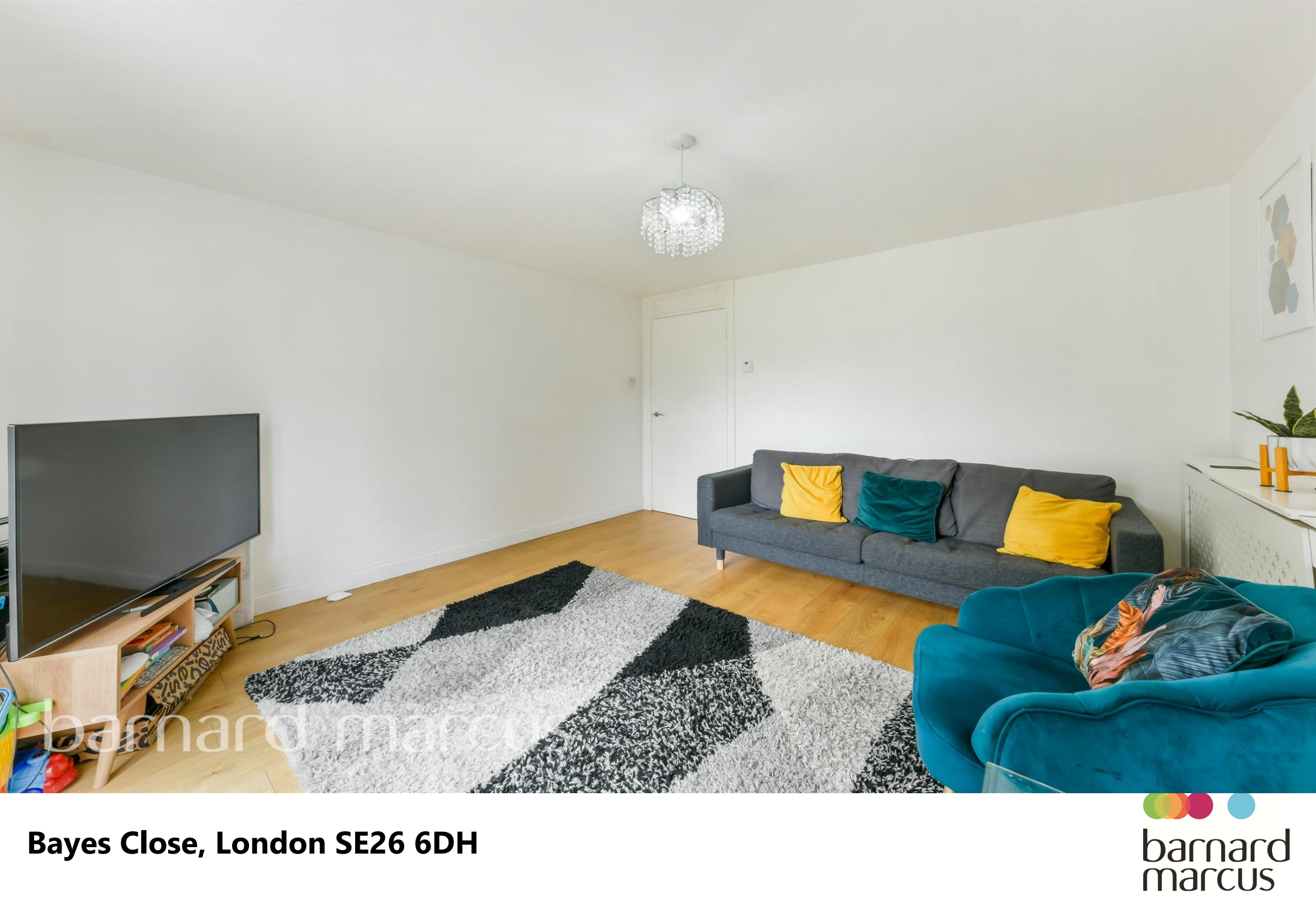
Bayes Close, London SE26 6DH