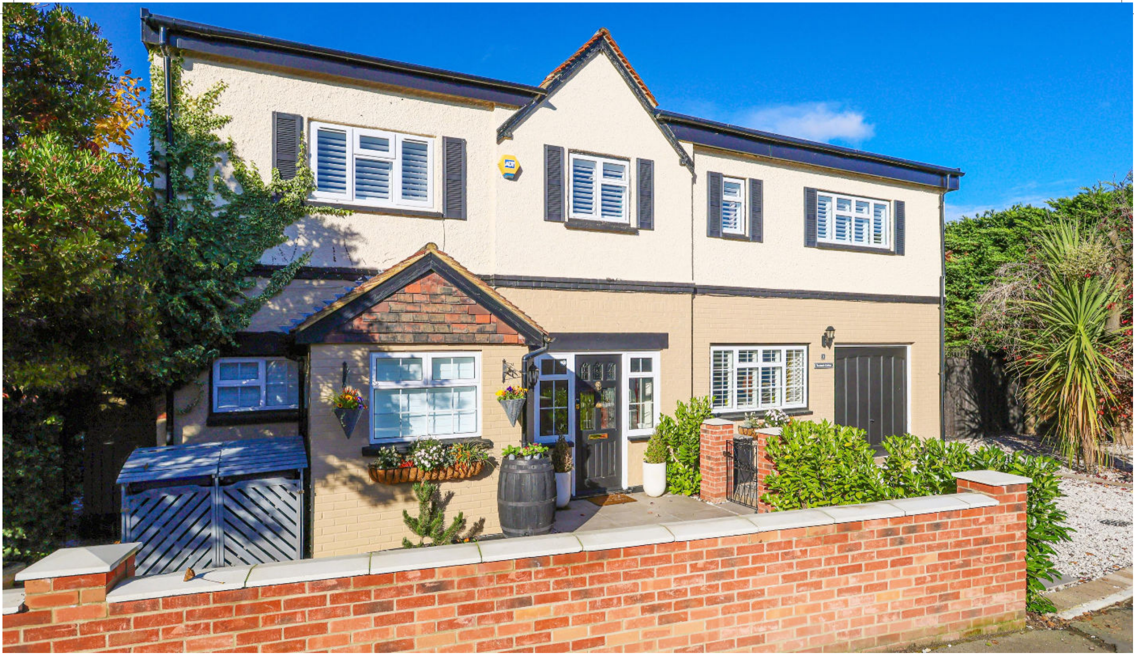
Castle Road, Weybridge