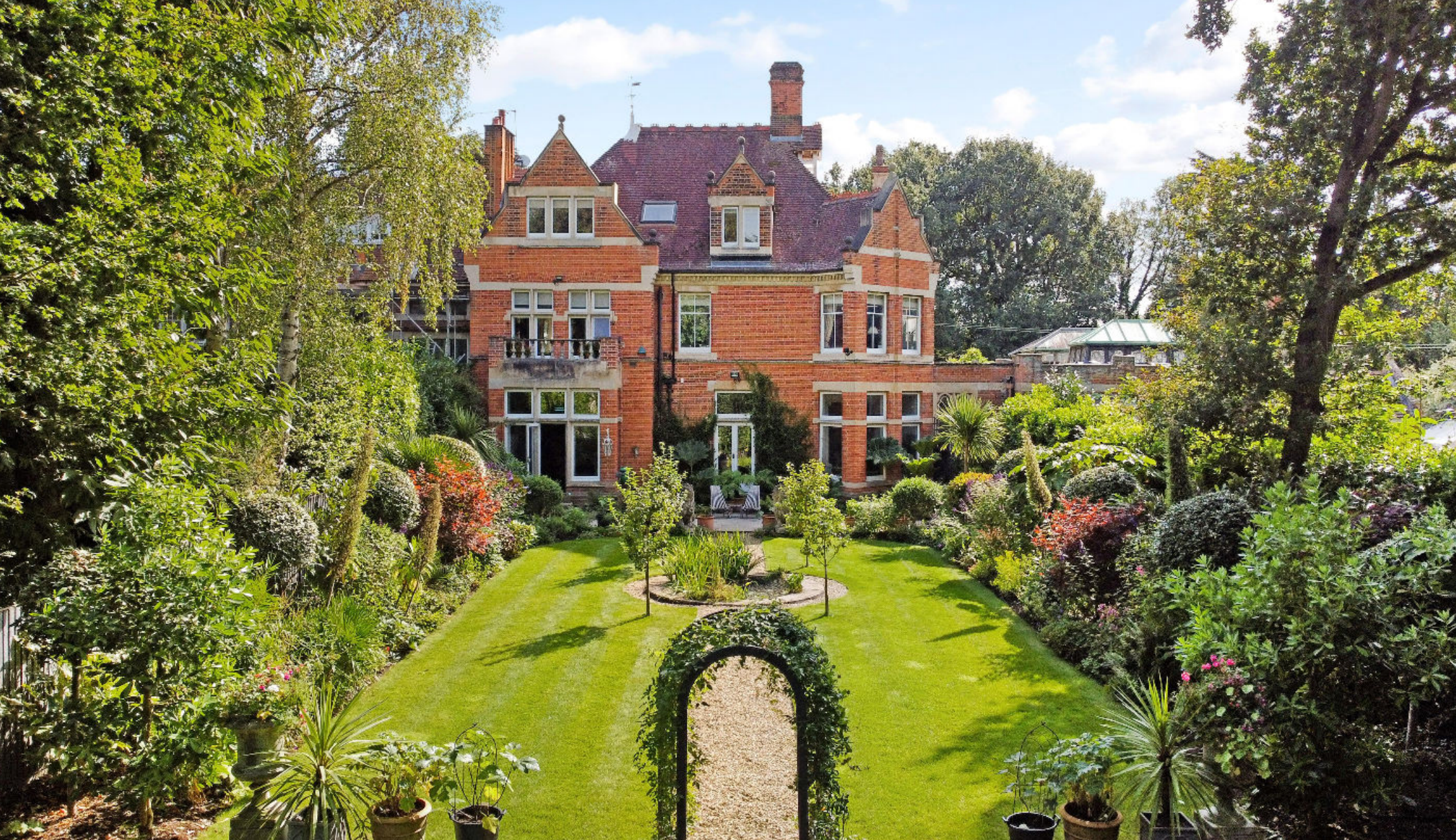
Woburn Hill, Addlestone