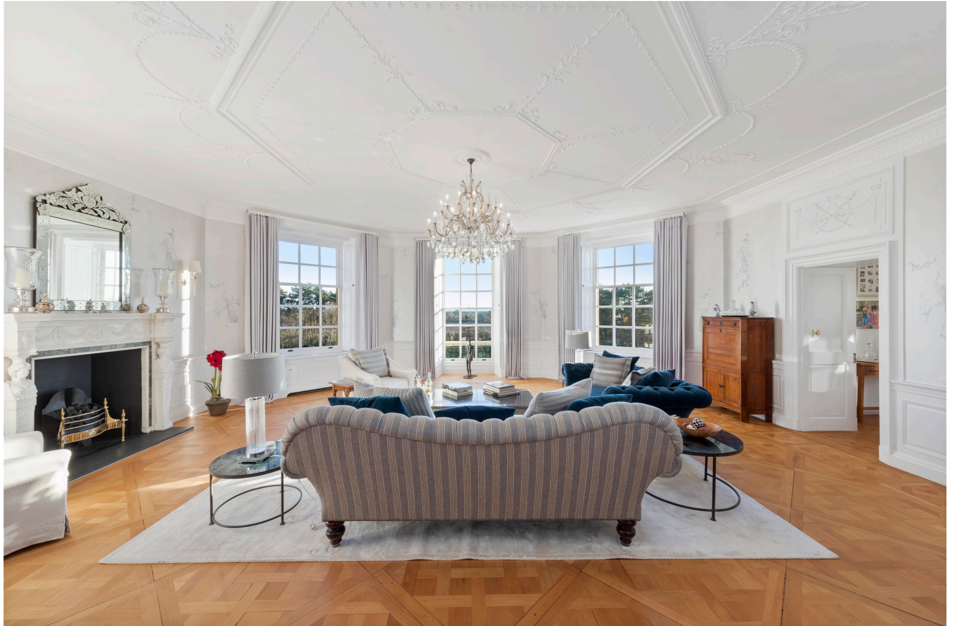
The Mansion, Ottershaw Park