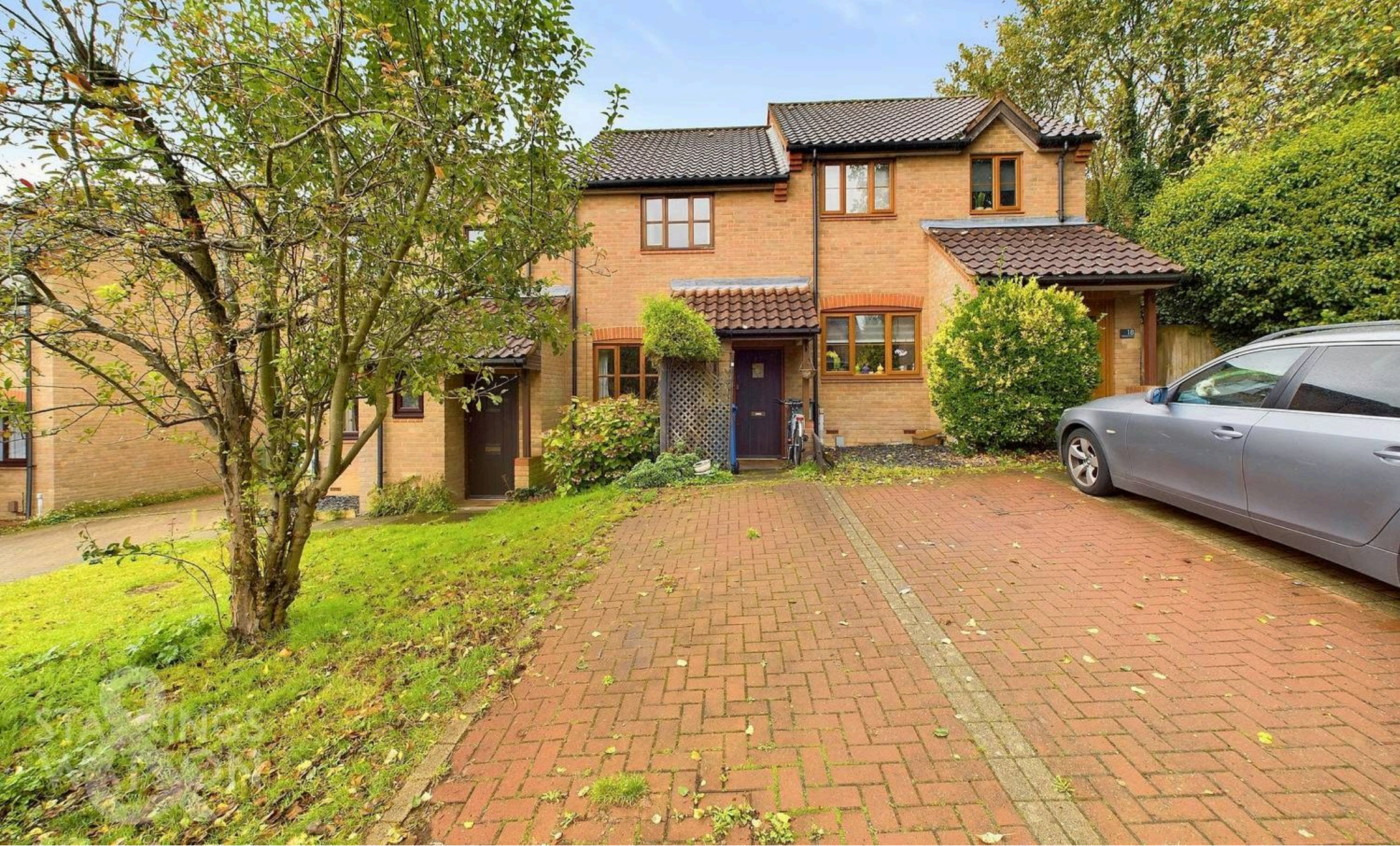
Airedale Close, Norwich - NR3 2DB