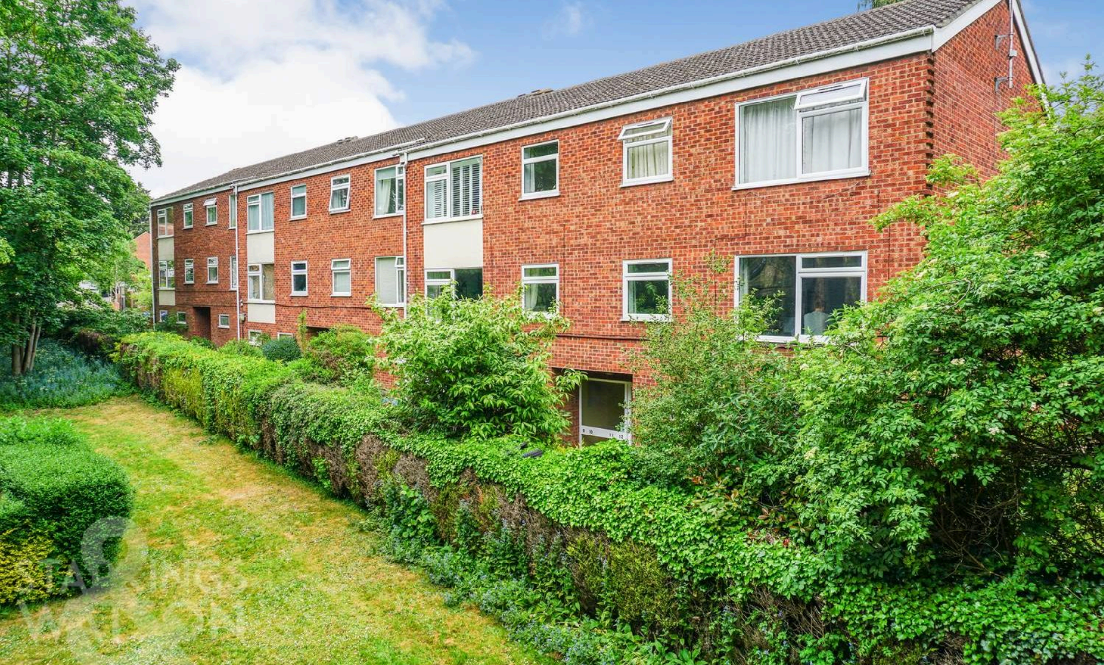
Halcombe Court, Norwich - NR3 4JX