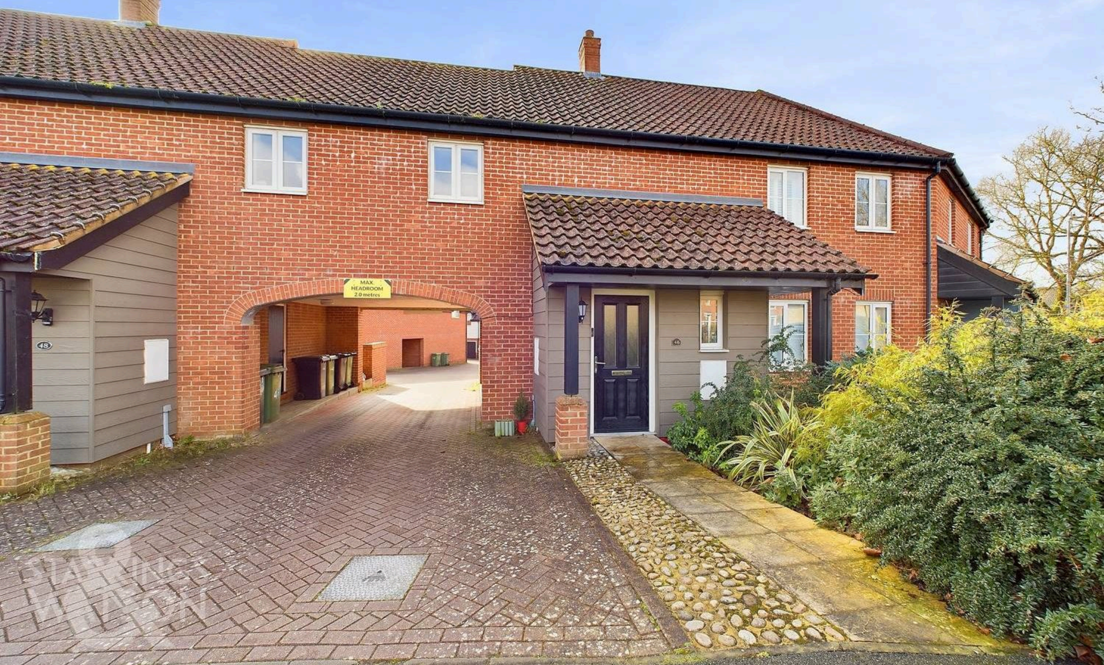
The Ridings, Poringland - NR14 7GE