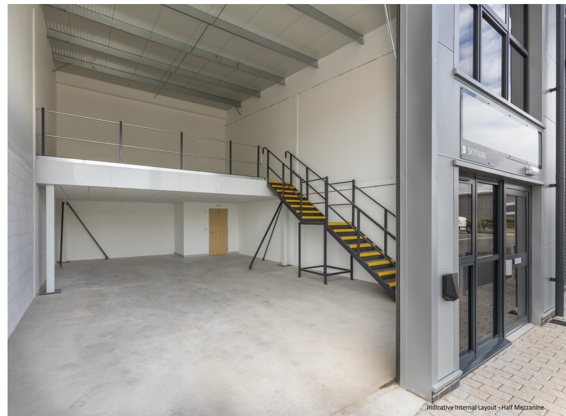
Indicative Internal Layout - Half Mezzanine