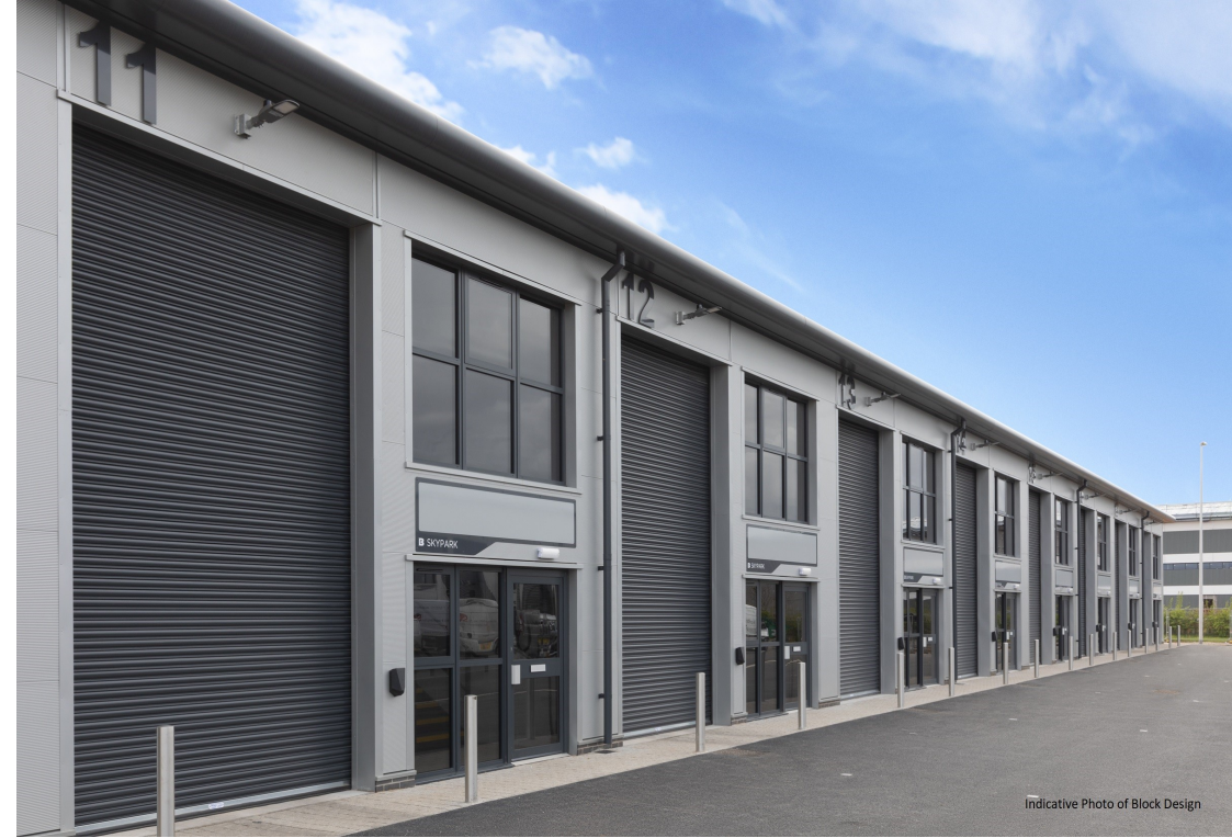
Indicative Photo of Block Design

The new build units will be built to an excellent standard, offering durable, adaptable, energy efficient commercial accommodation suitable for a range of business uses with floor space options of 1,000 to 4,000 sq ft.