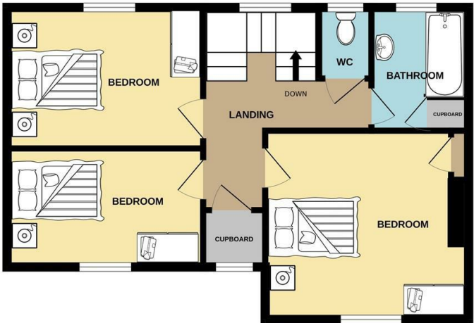
70 WEENSLAND ROAD, HAWICK

You may download, store and use the material for your own personal use and research. You may not republish, re transmit, redistribute or otherwise make the material available to any party or make the same available on any website, online service or bulletin board of your own or of any other party or make the same available in hard copy or in any other media without the website owner's express prior written consent. Bannerman Burke Properties Ltd copyright must remain on all reproductions of material taken from this website.