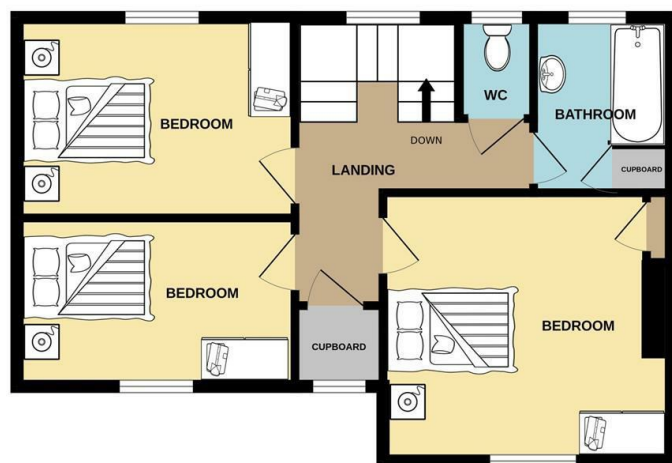
70 WEENSLAND ROAD, HAWICK