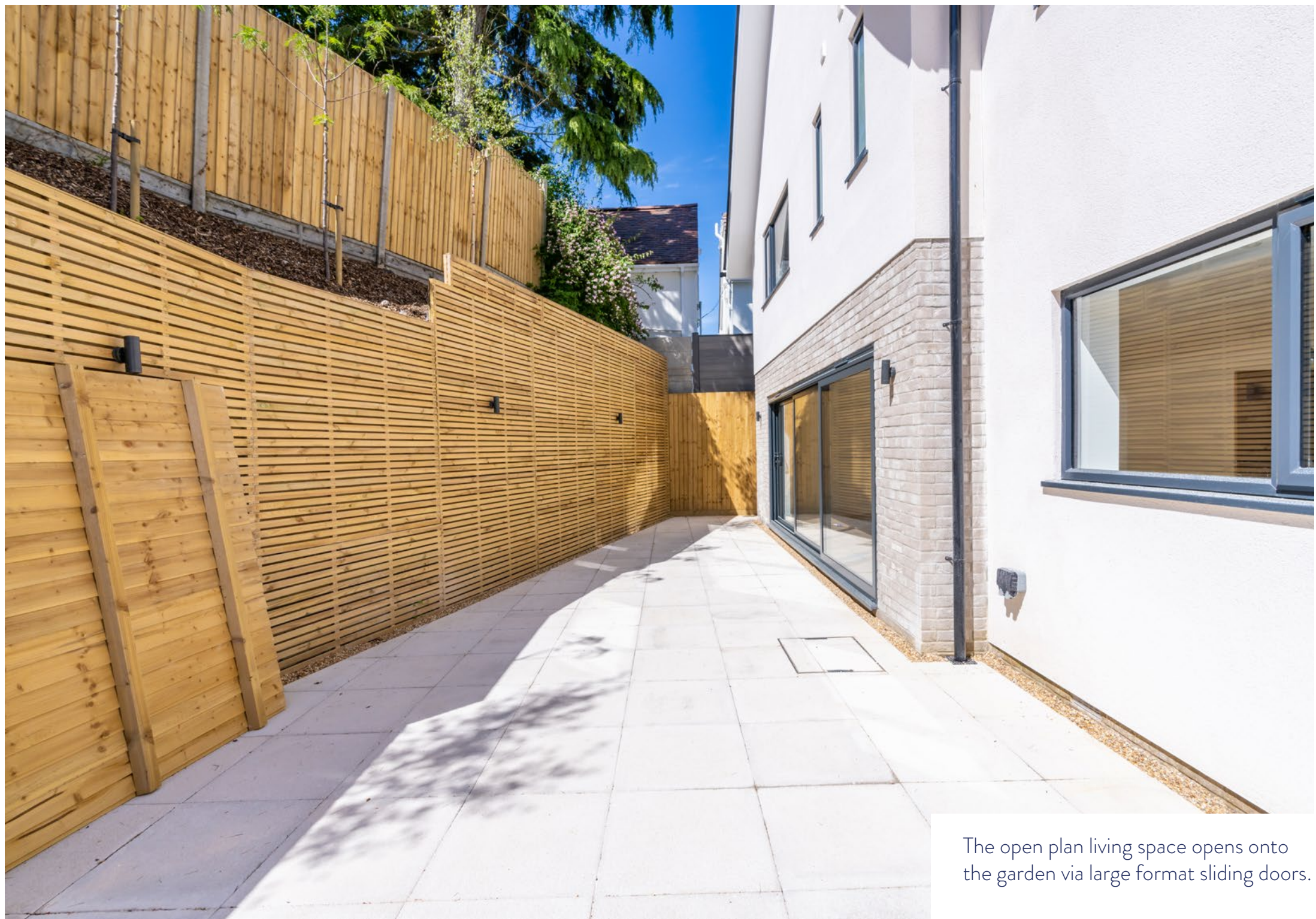
The open plan living space opens onto the garden via large format sliding doors.