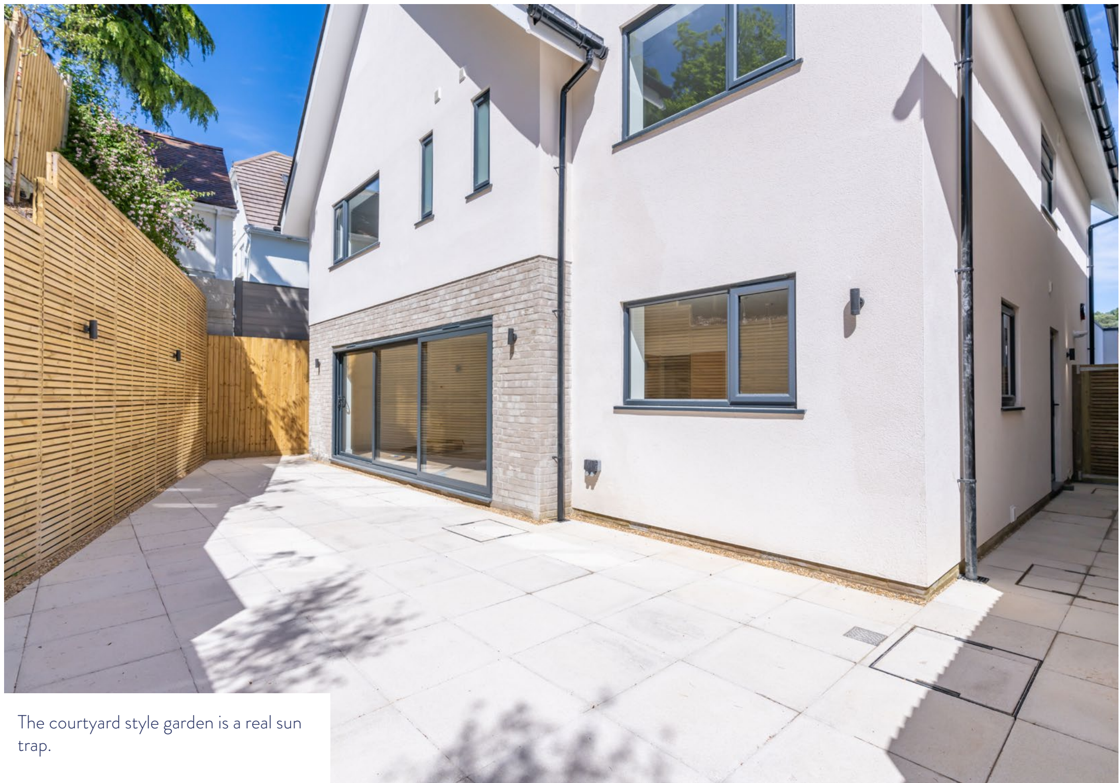
The courtyard style garden is a real sun trap.