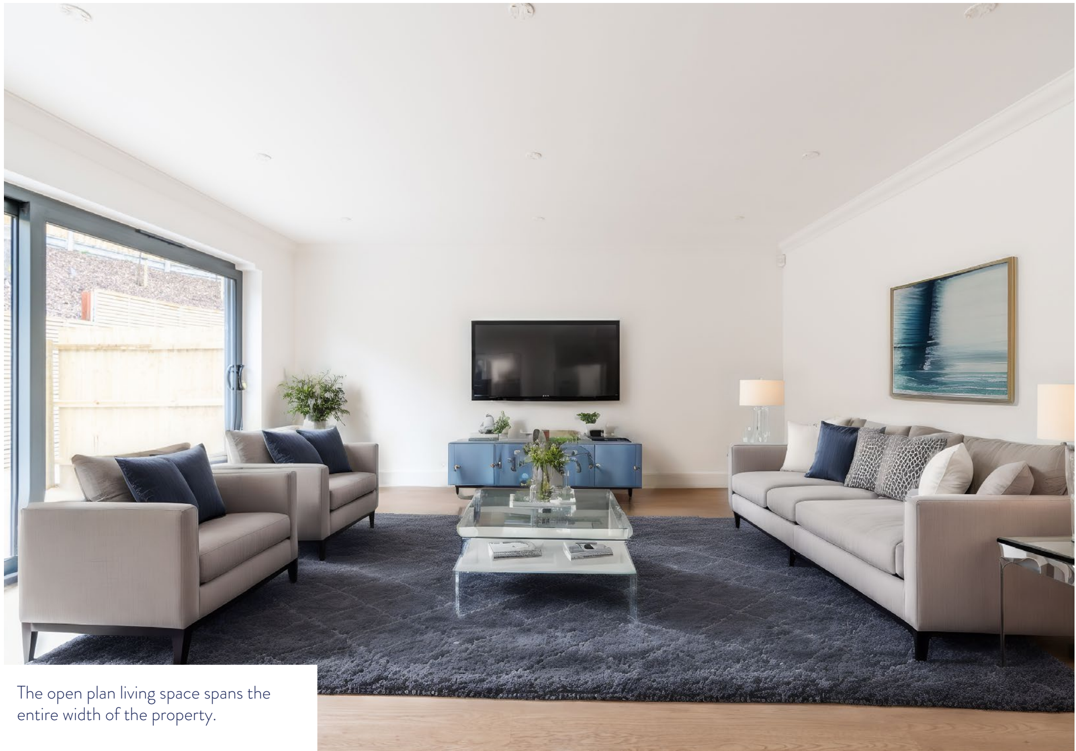
The open plan living space spans the entire width of the property.