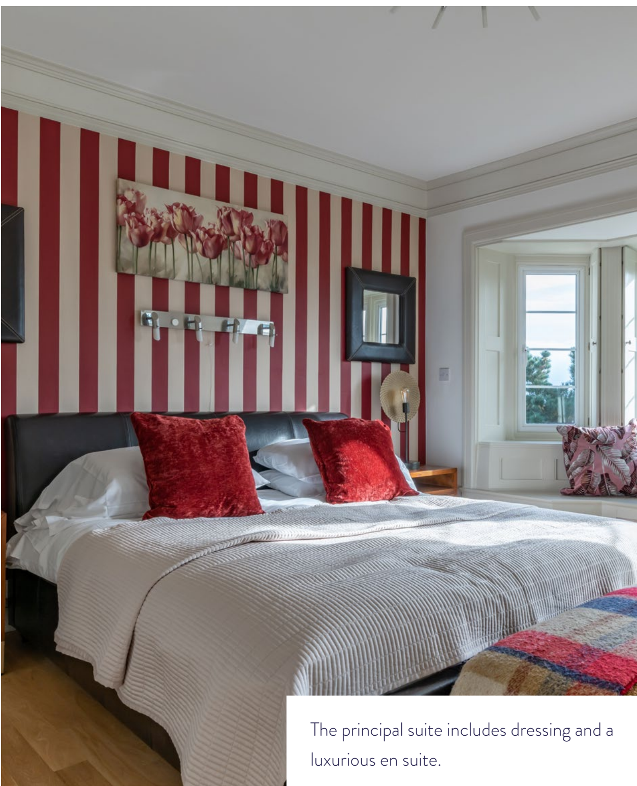
The principal suite includes dressing and a luxurious en suite.