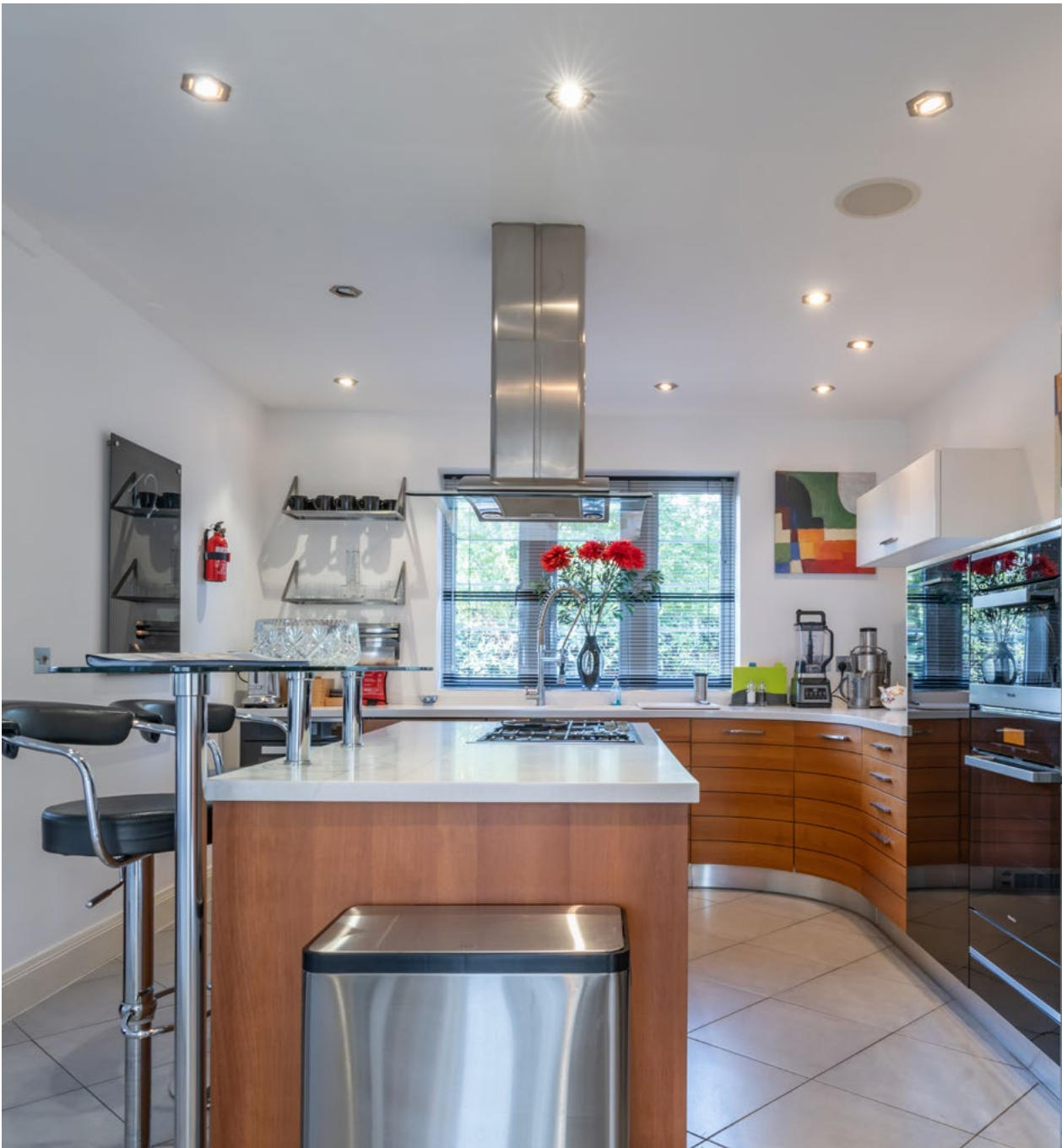
Whilst it is traditional in style, there are a number of contemporary features.