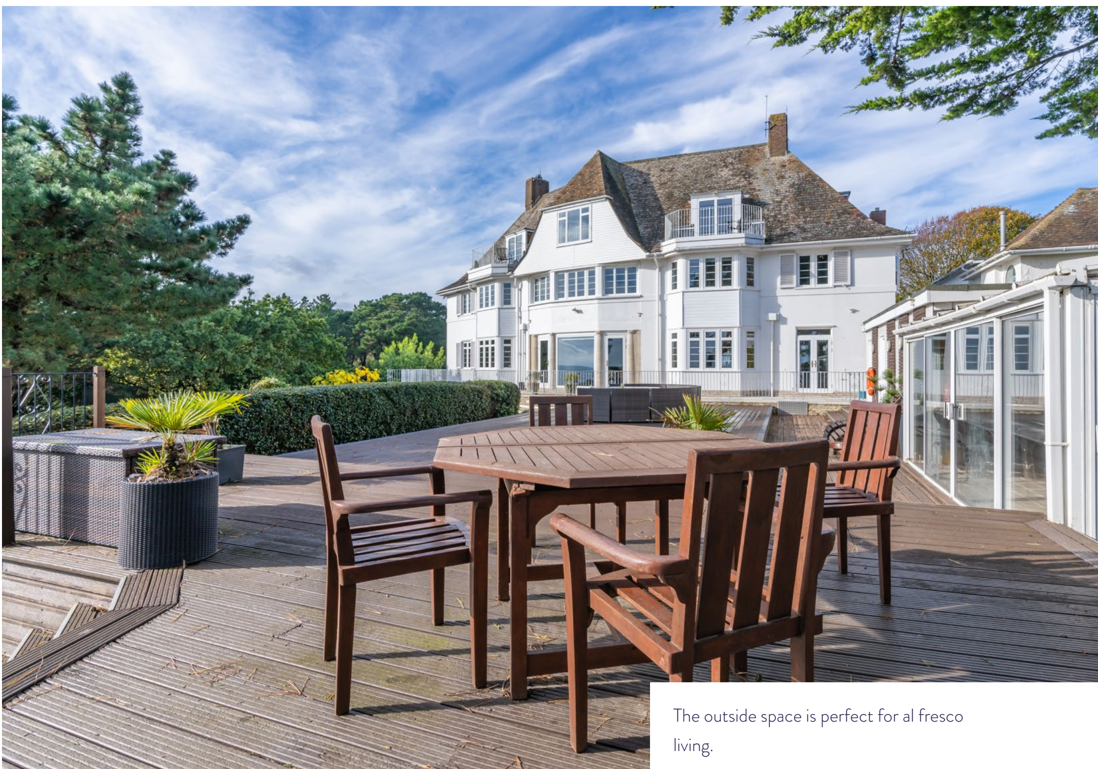
The outside space is perfect for al fresco living.