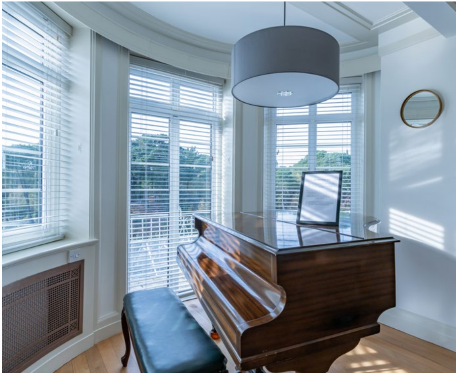
There are numerous reception spaces making it perfect for entertaining.