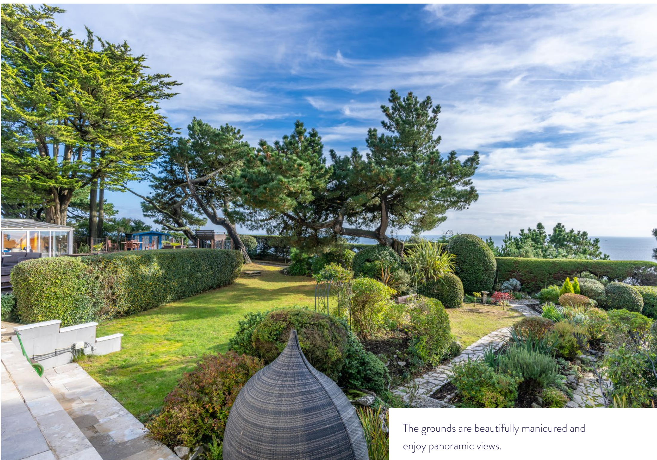
The grounds are beautifully manicured and enjoy panoramic views.