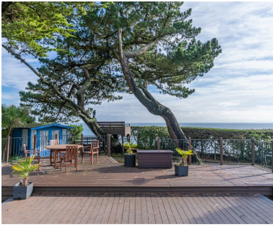
The views over the beach can be enjoyed from numerous vantage points.