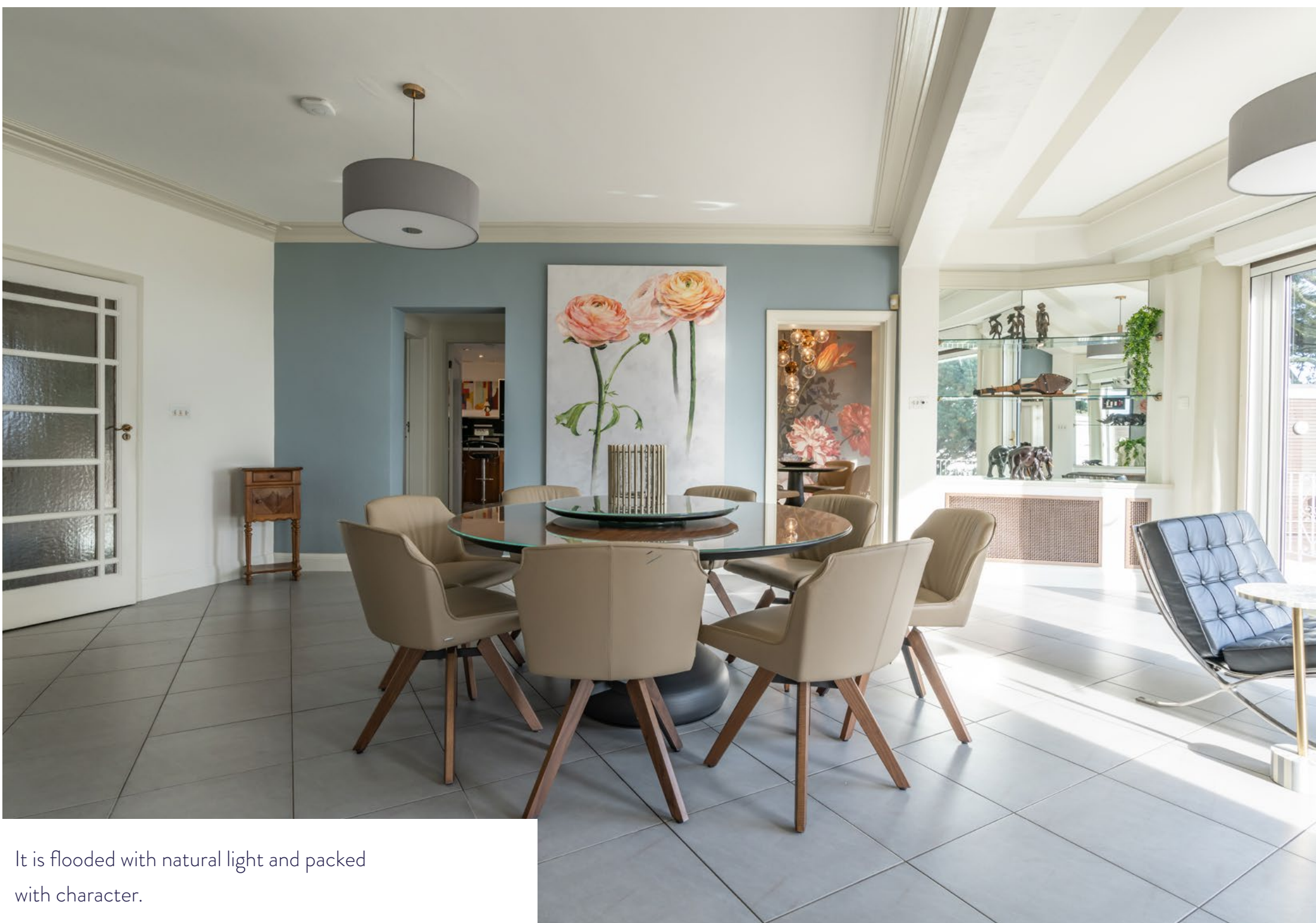
It is flooded with natural light and packed with character.