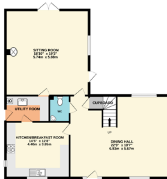
Ground Floor Area 97.8 SQ.M (1052 SQ.FT.)