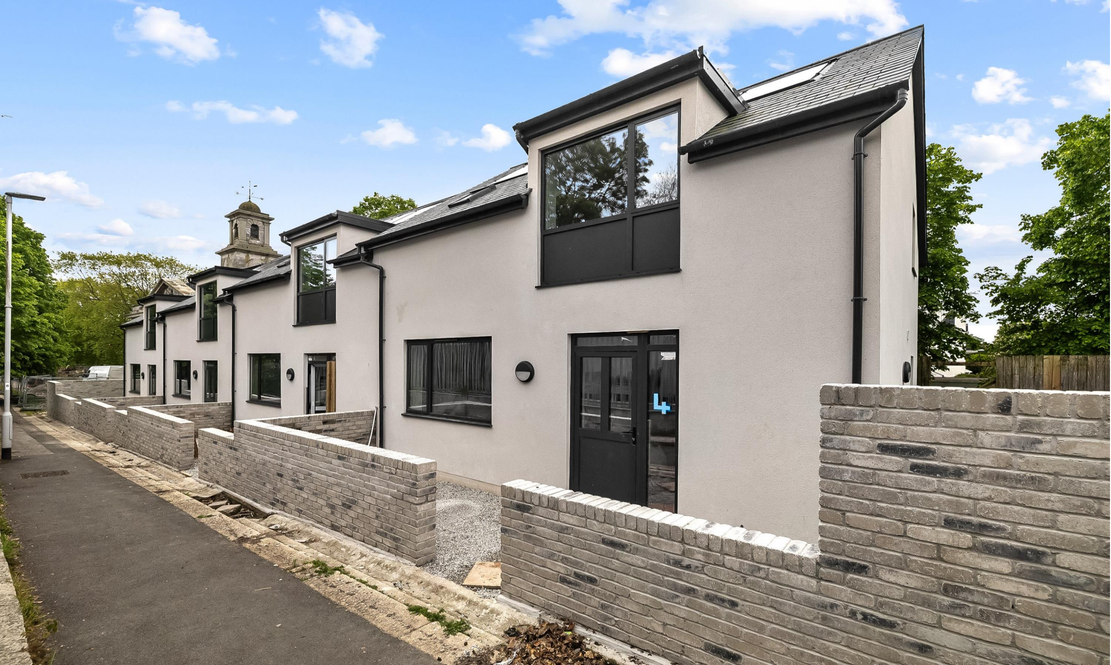
Plot 8 Raglan Gatehouse, Madden Road, Devonport, Plymouth, Devon, PL1 4NE