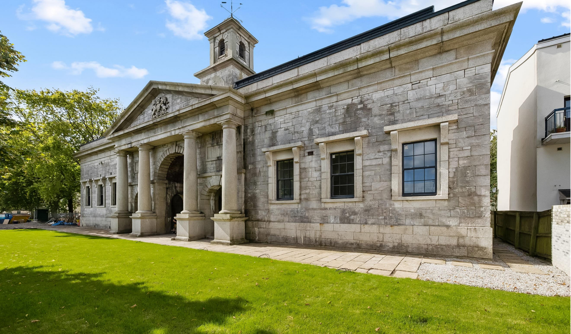
Plot 3 Raglan Gatehouse, 53 Madden Road, Devonport, Plymouth, Devon, PL1 4NE