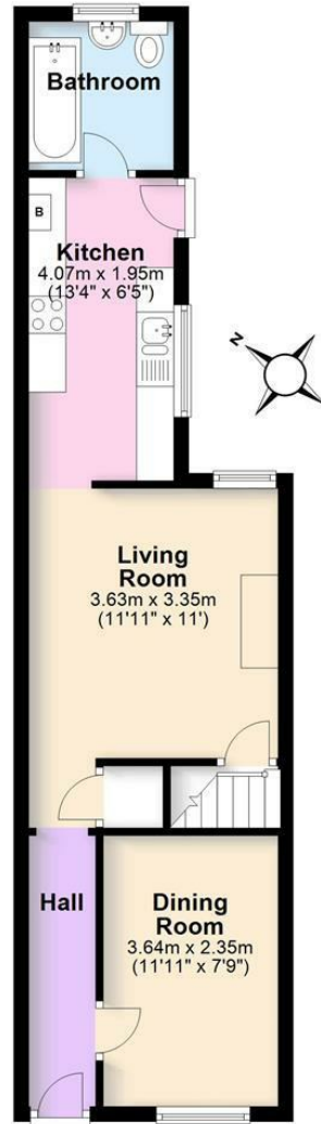
First Floor Approx. 39.8 sq. metres (428.9 sq. feet)