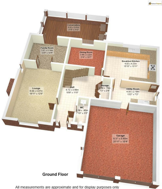
All measurements are approximate and for display purposes only