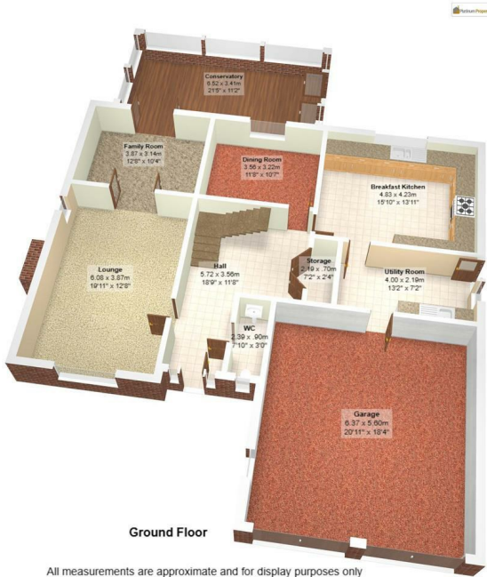
All measurements are approximate and for display purposes only