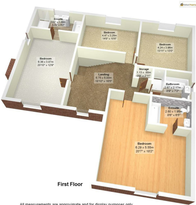
All measurements are approximate and for display purposes only