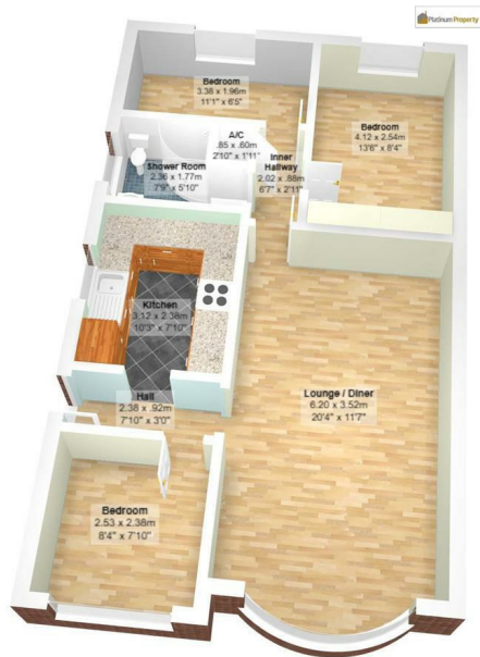
Ground Floor All measurements are approximate and for display purposes only

Please contact our Stoke-on-Trent Office on 01782 392211 if you wish to arrange a viewing appointment for this property or require further information.