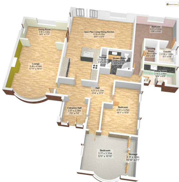
Ground Floor All measurements are approximate and for display purposes only